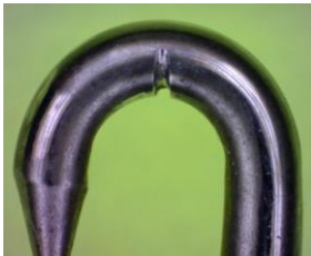
Uncoated used needle showing wear mark in "crook"