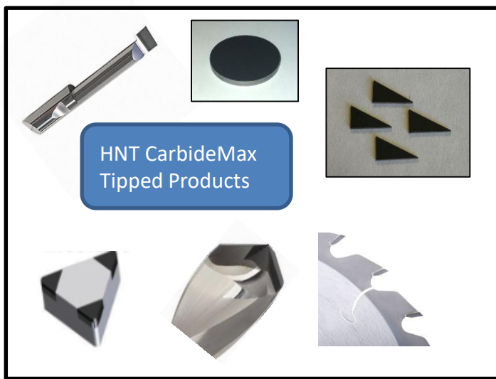
HNT CarbideMax Tipped Products